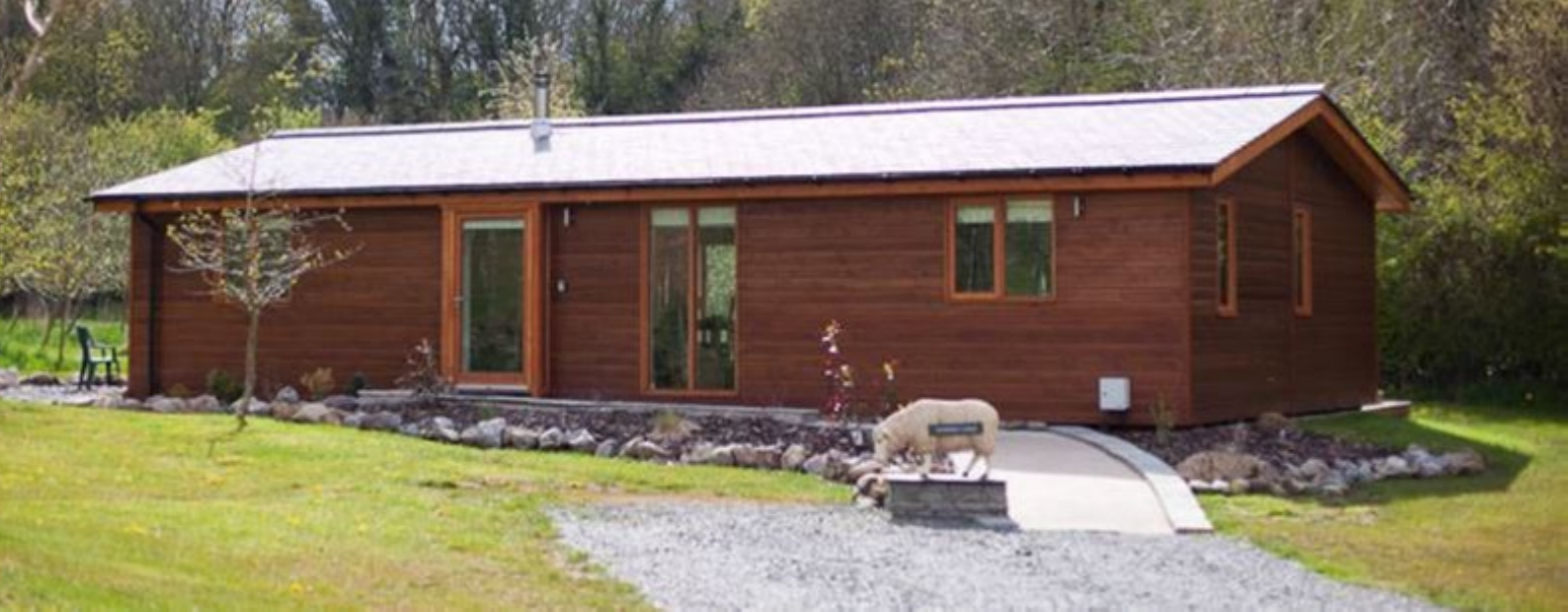
Proposed Style of Lodge