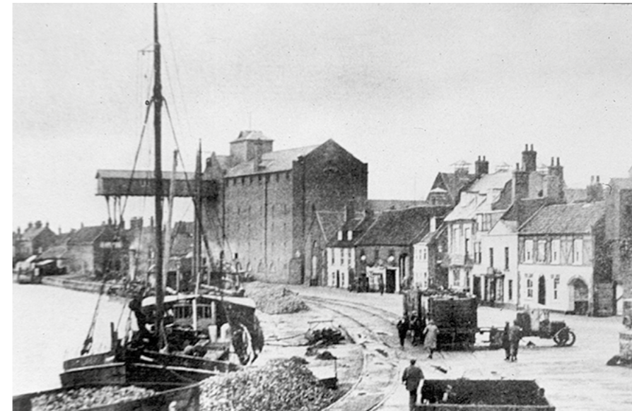
WELLS-NEXT-THE-SEA QUAY Historic photograph of the quay at Wells-next-the-Sea