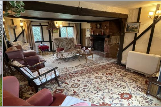
April Cottage | Mill Green | Stonham Aspal | IP14 6DA

Specialist marketing for | Barns | Cottages | Period Properties | Executive Homes | Town Houses | Village Homes