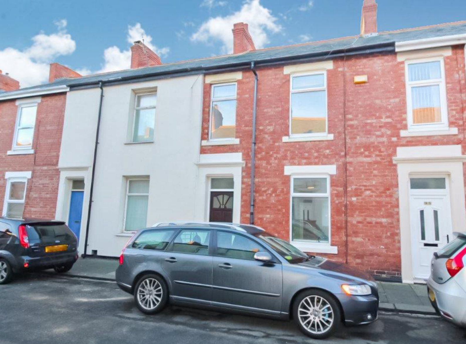
Beaumont Street, Blyth £595 pcm