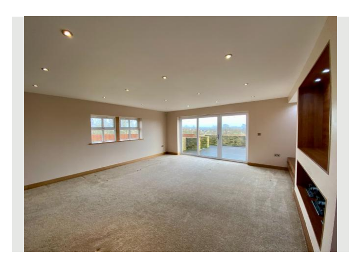
\begin{array}{c} \text{Creation Date} \\ \textbf{03}/\textbf{03}/\textbf{2023} \end{array}