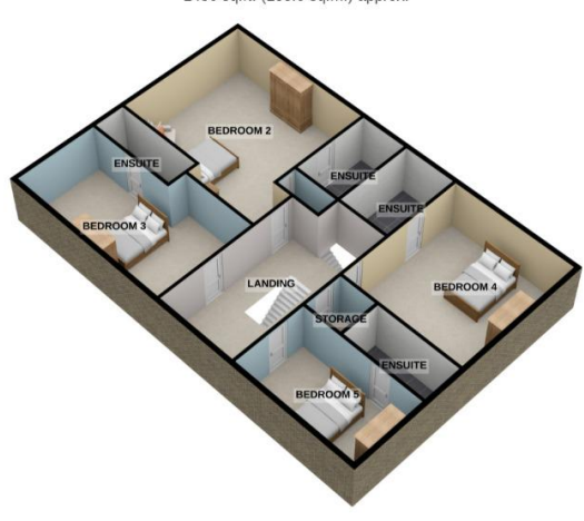
2ND FLOOR 1502 sq.ft. (139.6 sq.m.) approx.