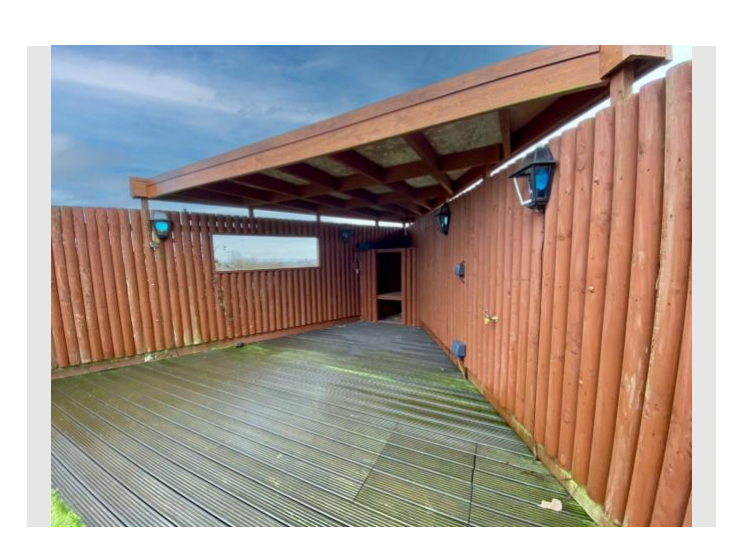
\begin{array}{c} \text{Creation Date} \\ \textbf{03}/\textbf{03}/\textbf{2023} \end{array}