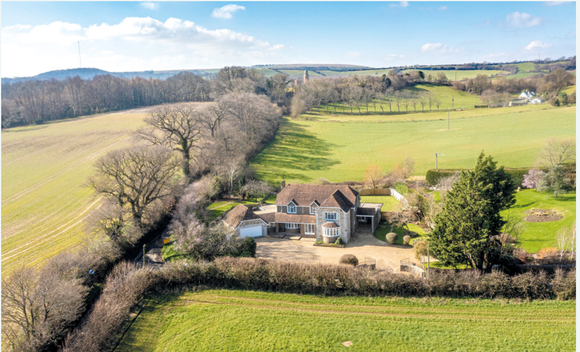
Kendal House, Marvel Lane, Blackwater, Isle of Wight