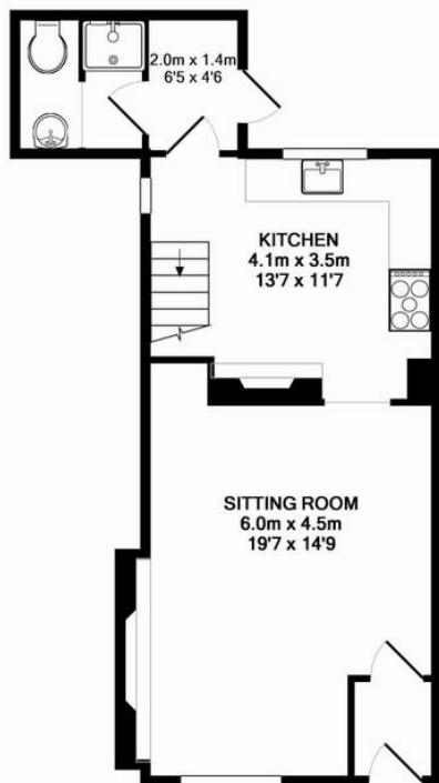
GROUND FLOOR APPROX. FLOOR AREA 43.8 SQ.M. (472 SQ.FT.)