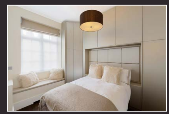
Price: £2,395,000 Tenure: Leashold with 962 years remaining with share of freehold Service Charge: £13,244.56 per annum Ground Rent: Peppercorn