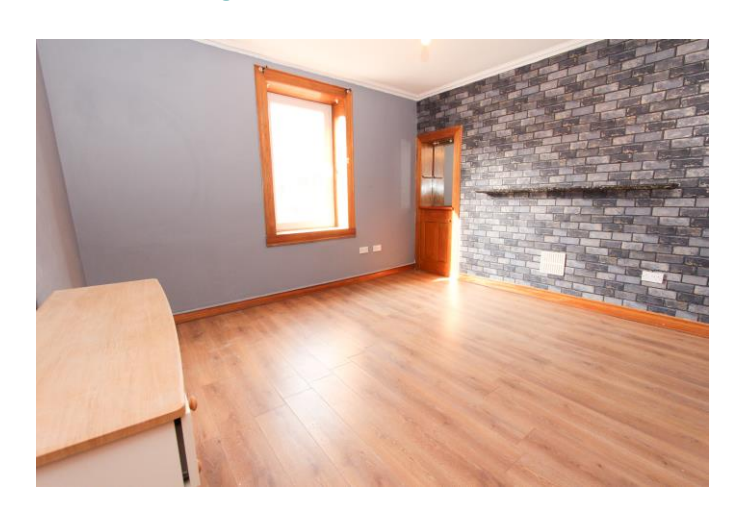
BEDROOM 2: A bedroom to the rear with CH radiator.