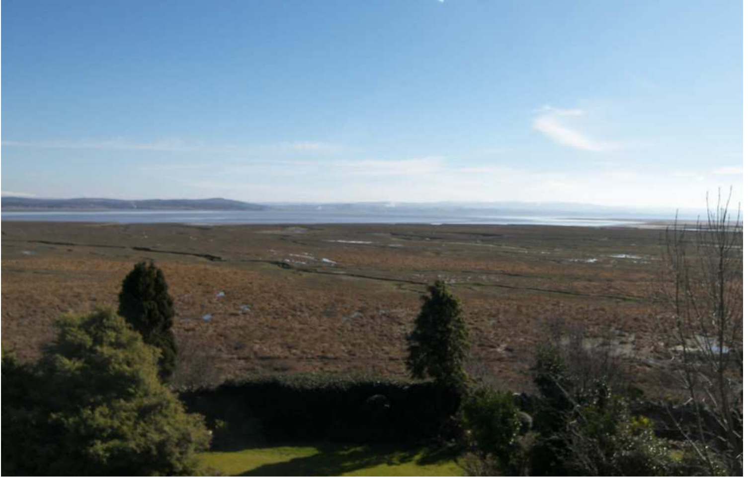
View from Lounge