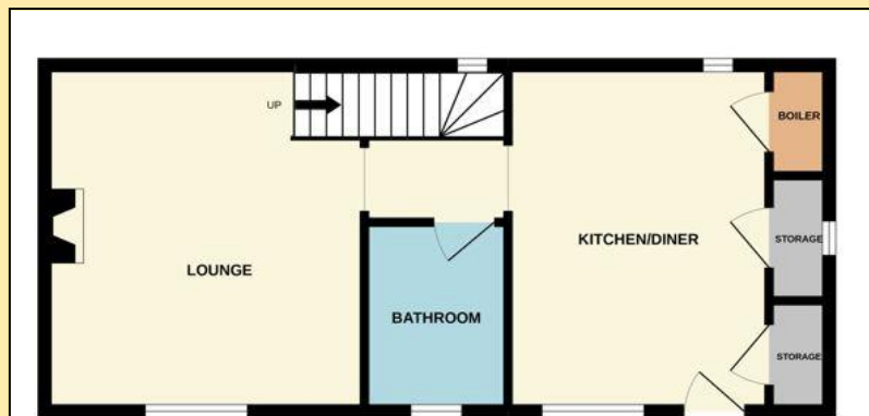
1ST FLOOR 464 sq.ft. (43.1 sq.m.) approx.