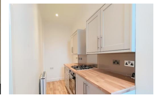
8 Jester Place Queensbury, Bradford, , BD13 1JP