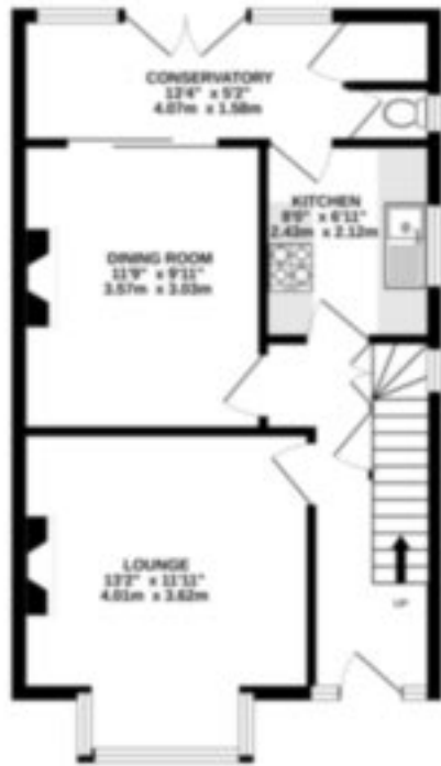
GROUND FLOOR 472 sq ft. (43.8 sq m.) approx.