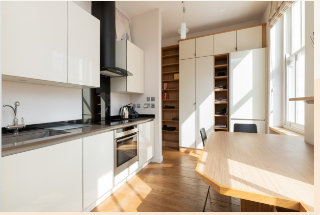
Great Windmill Street, Soho W1