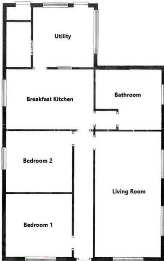
89 Sutton Road, Terrington St Clement

Illustration for identification purposes only. Not to scale.