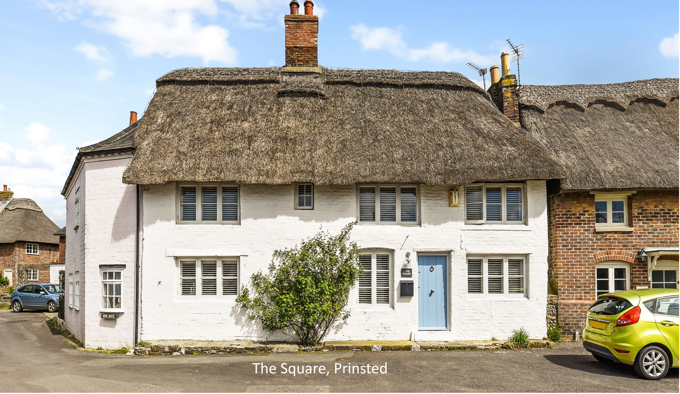
The Square, Prinsted