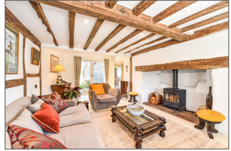
1 The Square, Prinsted, PO10 8HT.