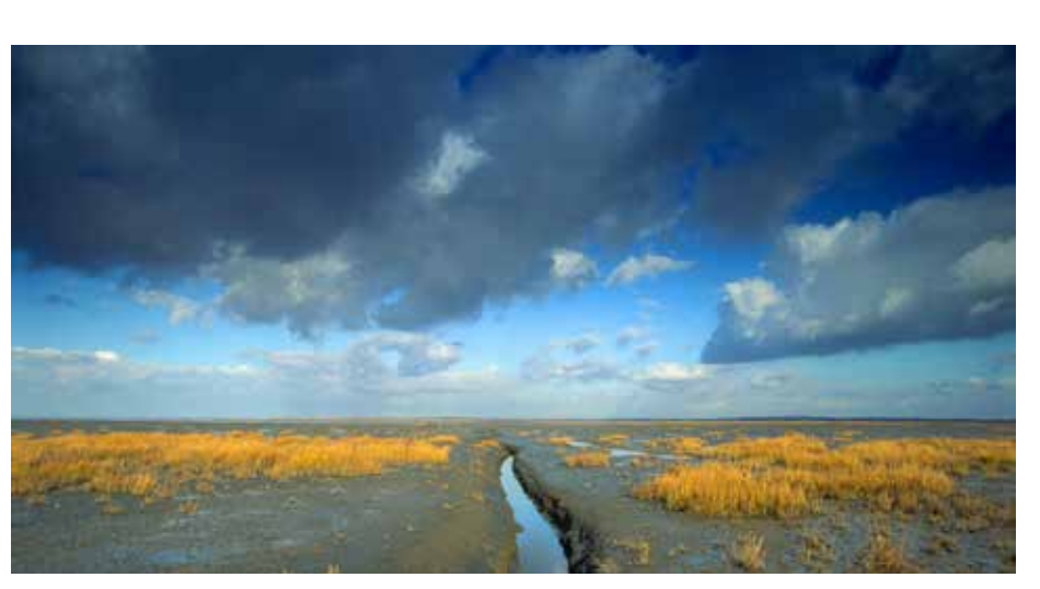
Terrington St. Clement, The Wash

"The ideal country village with amenities on your door step and close by railway links connecting you to London."