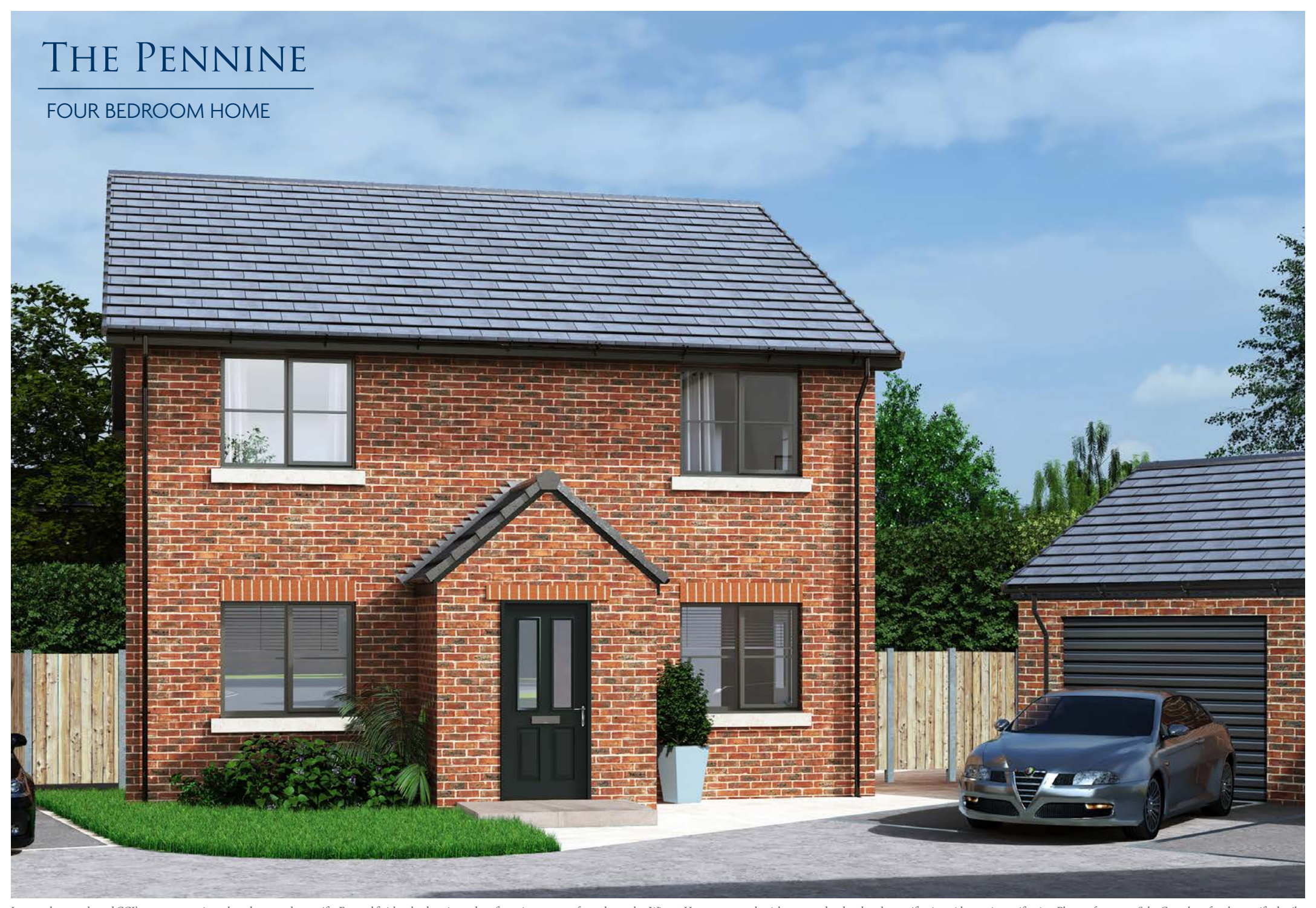
Images, photographs and CGI's are representative only and are not plot specific. External finishes, landscaping and configuration may vary from plot to plot, Wiggett Homes reserves the right to amend and update the specification without prior notification. Please refer to your Sales Consultant for plot specific details.