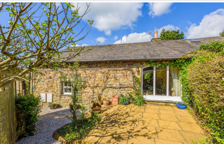
Rear Garden / Patio

Strictly by appointment with Hackney & Leigh Kirkby Office.