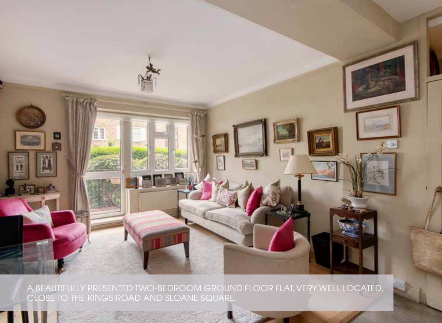
A BEAUTIFULLY PRESENTED TWO-BEDROOM GROUND FLOOR FLAT, VERY WELL LOCATED, CLOSE TO THE KINGS ROAD AND SLOANE SQUARE.