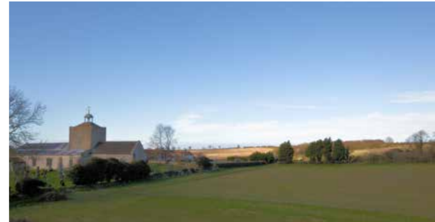
St Clement's Church, Burnham Overy Town

"...the beauty of this village is that it is far enough away to remain peaceful even at the busiest times of the year."