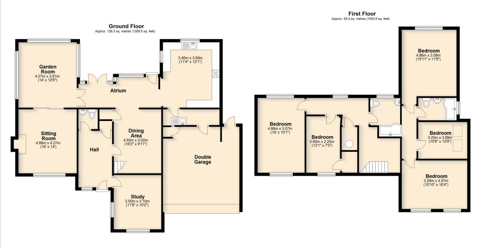
Total area: approx. 219.6 sq. metres (2363.4 sq. feet)

While we endeavour to make our sales particulars accurate and reliable, if there is any point which is of particular importance to you, please contact this office and we will be pleased to check the information for you, particularly if contemplating travelling some distance to view the property.