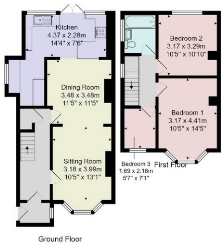
Total Area: 89.7 m² ... 966 ft² All measurements are approximate and for display purposes only. No liability is accepted by either the agency or Box Property Solutions Ltd as to the exact measurements of the rooms. Box Property Solutions Ltd retains the copyright on this plan and allows agents to use it with agreed permission.