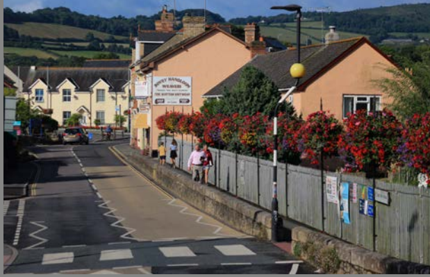
Please note: All images above depict the surrounding area.