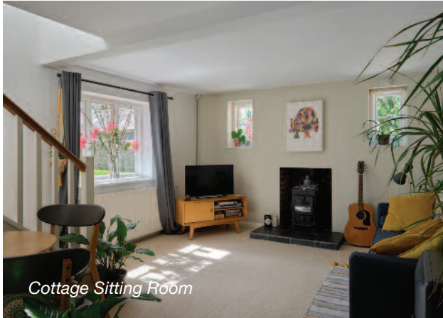
Cottage Sitting Room