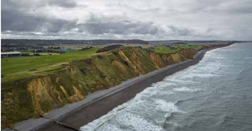
Sheringham on the north Norfolk coast.

“The local area allows for excellent dog walking and access to the ever popular north Norfolk coast.”