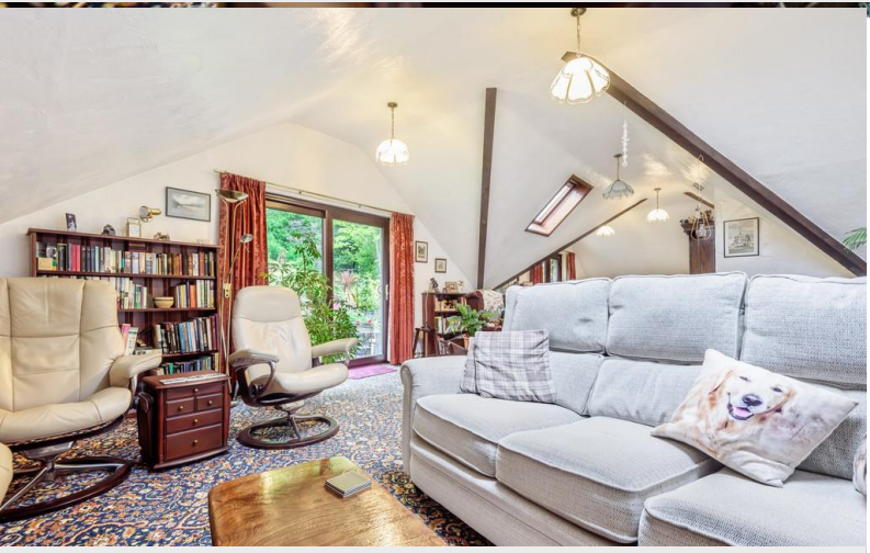
Open plan Living/Dining Room