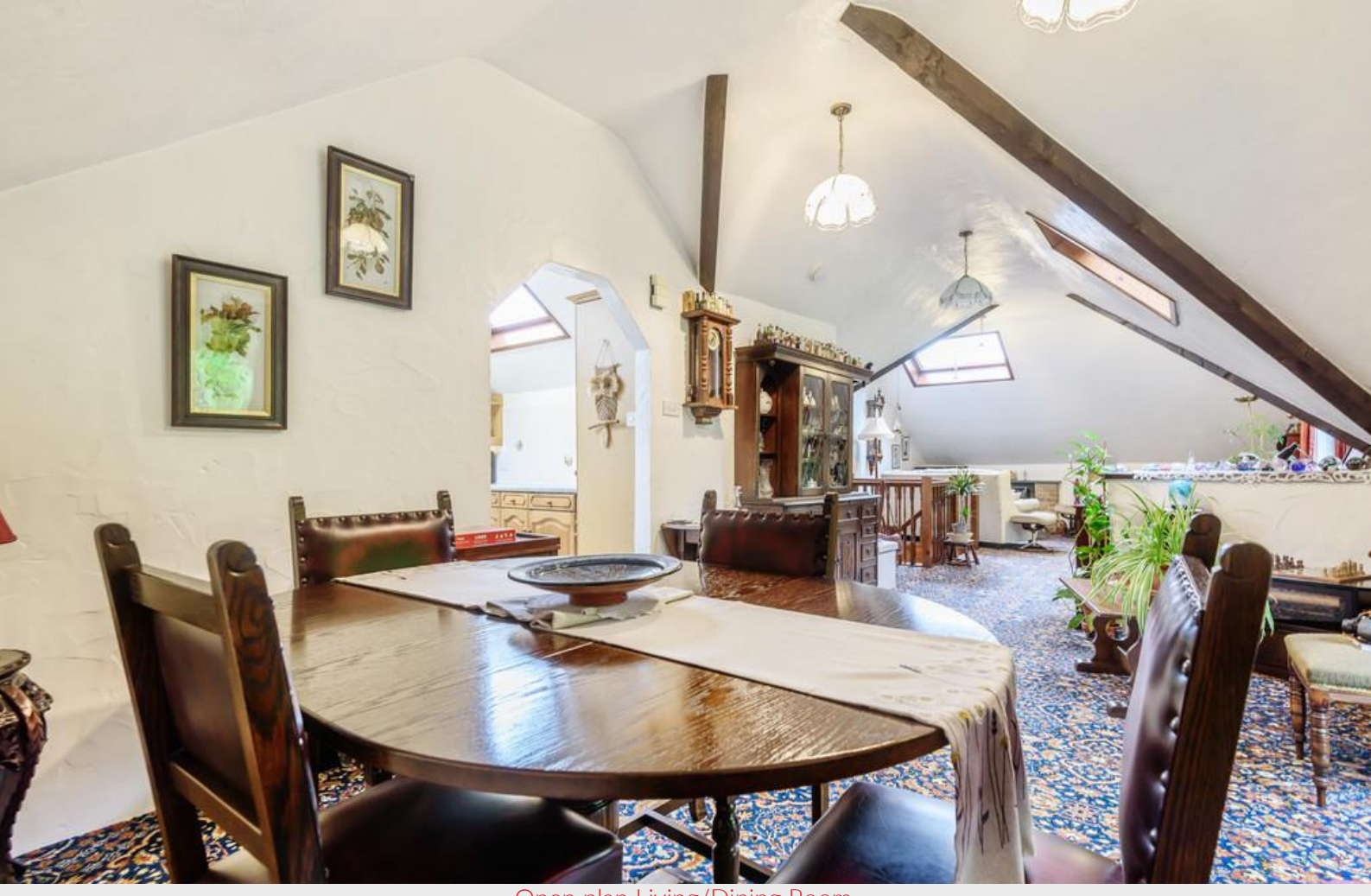
Open plan Living/Dining Room