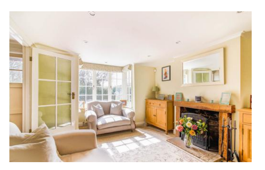
Woodgreen Cottage, Upshire, Essex, EN9 3SD