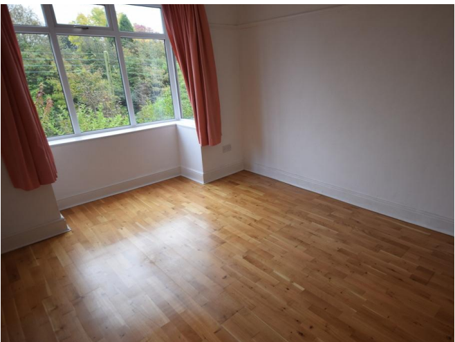
BEDROOM TWO Window to front elevation, laminate flooring, coving, picture rail, radiator

BATHROOM Window to rear elevation, comprising low level WC, wash hand basin, corner bath with shower over, shower curtain, tile effect flooring, tiled walls, radiator