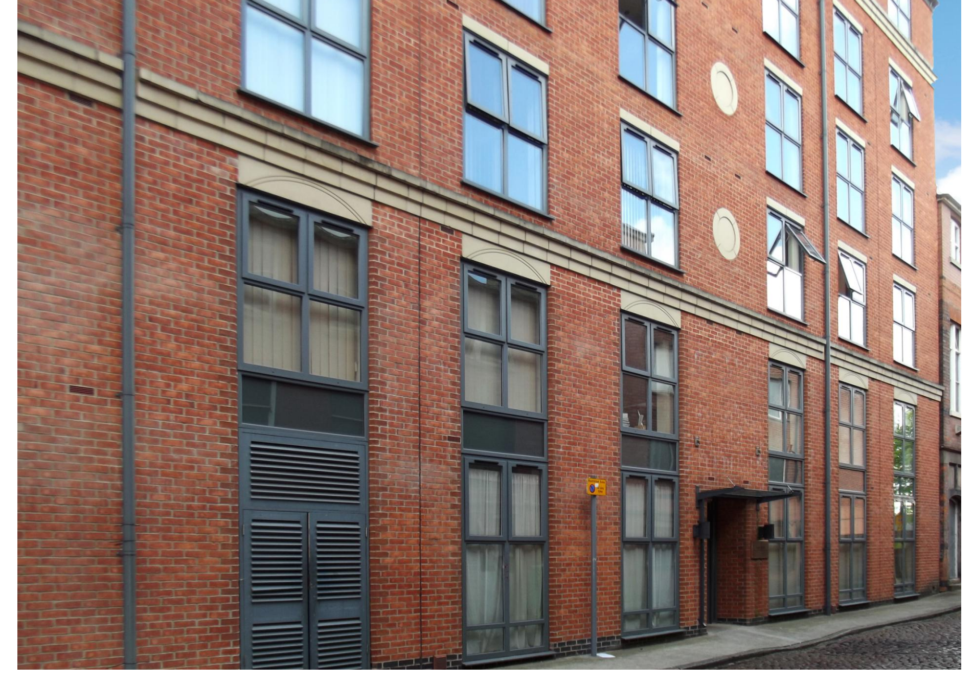
4 New Court, Ristes Place, Nottingham, NG1 1JT £140,000 Leasehold