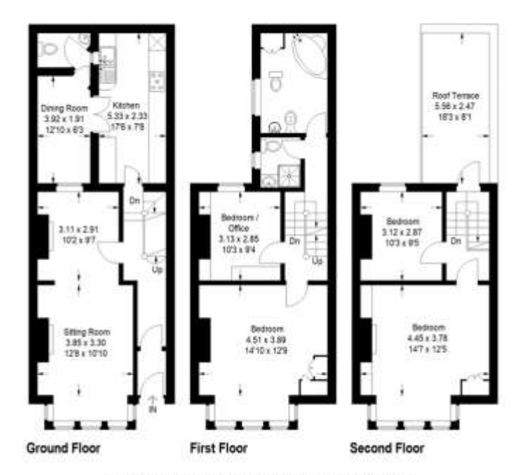
Businston for identification purposes only, measurements are approximate, not to scale. Intagoplansurveys @ 2022