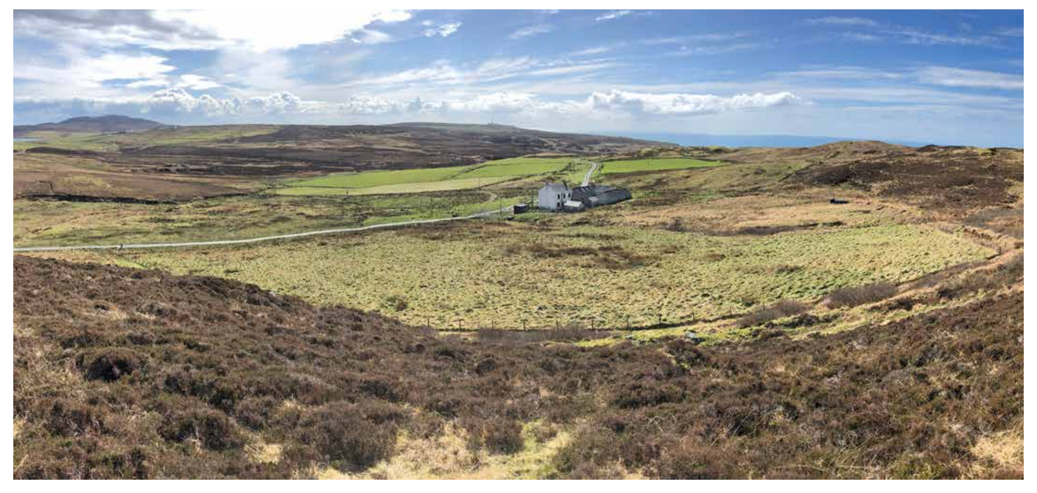
Above: Showing land to the rear of Fangdhu. In the distance, Loch Kinnabus can be seen to the left, the American Monument and North Channel across to Northern Ireland on the right.