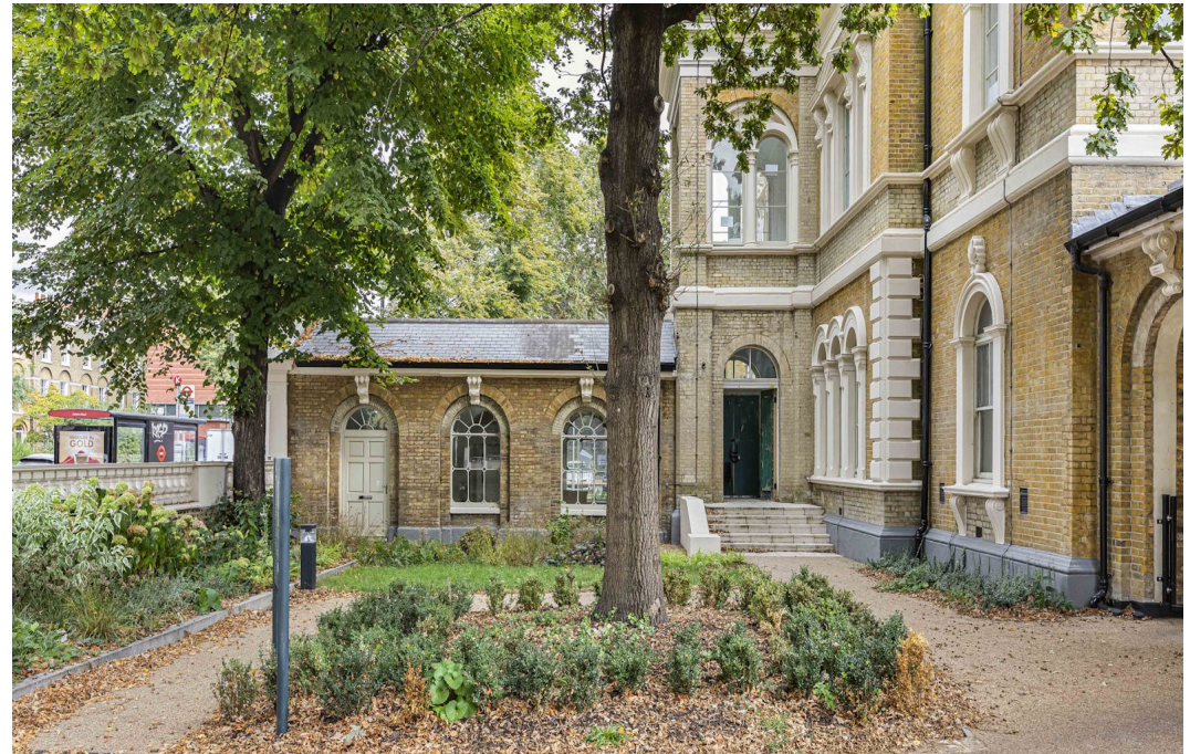
The John Denham Building, St Clements Hospital, Mile End Road, London, E3 4LH