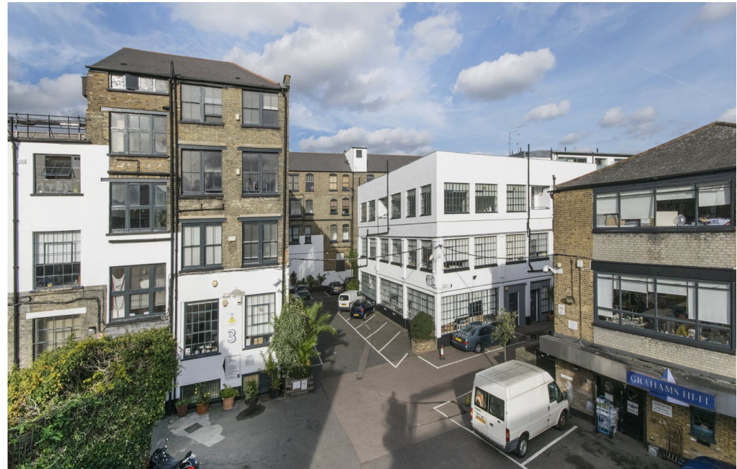
Unit 2, Shepperton House, Canonbury Yard, 190 New North Road, London, N1 7BJ