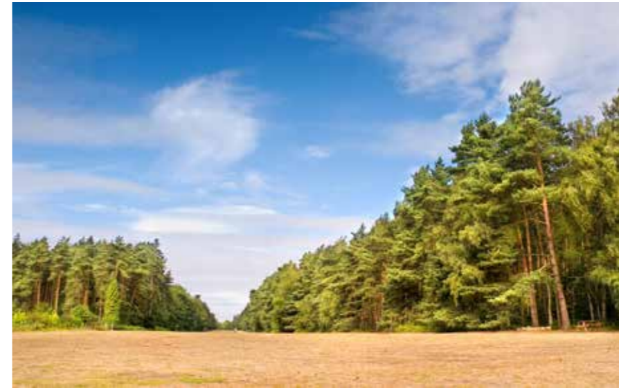
Sandringham Estate is only a short car journey from South Wootton.

“We love a short drive to the Sandringham Estate for great woodland walks.”