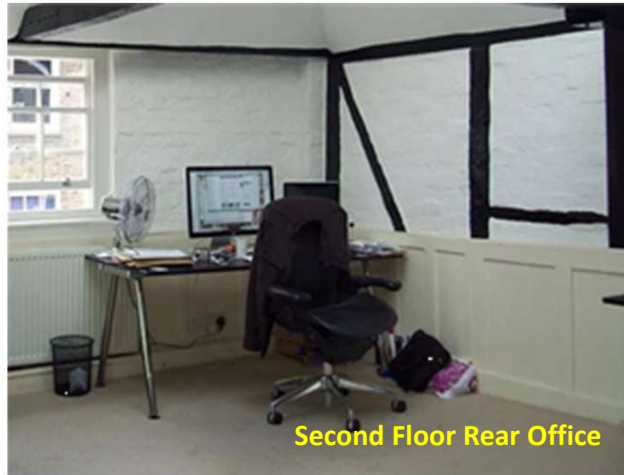
Second Floor Rear Office