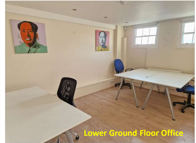
Lower Ground Floor Office

These particulars do not constitute, or form any part of, any offer or contract, and whilst all the information given is believed to be correct, all interested parties must satisfy themselves of its accuracy. All prices and rents are quoted exclusive of VAT, unless otherwise stated.