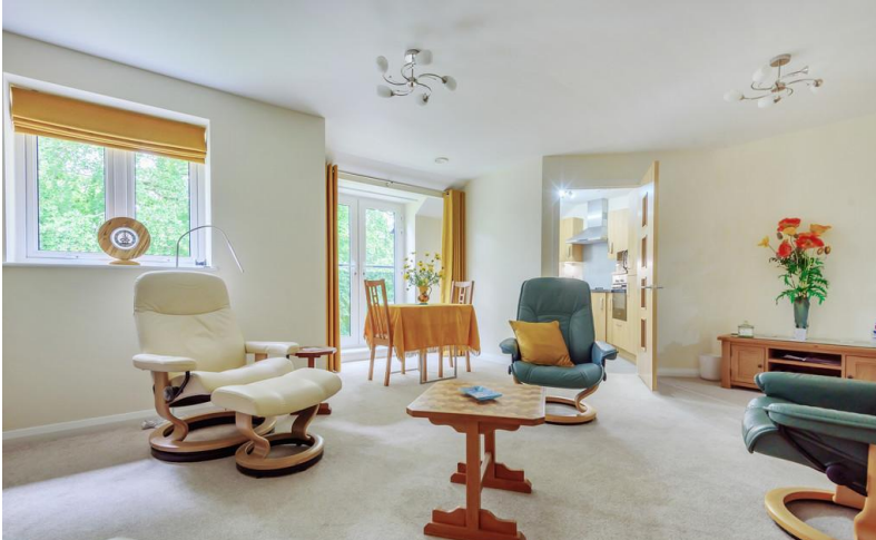
Open Plan Living/Dining Room