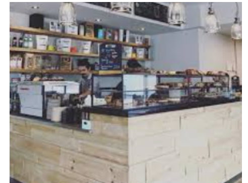
No 6 Coffee Shop