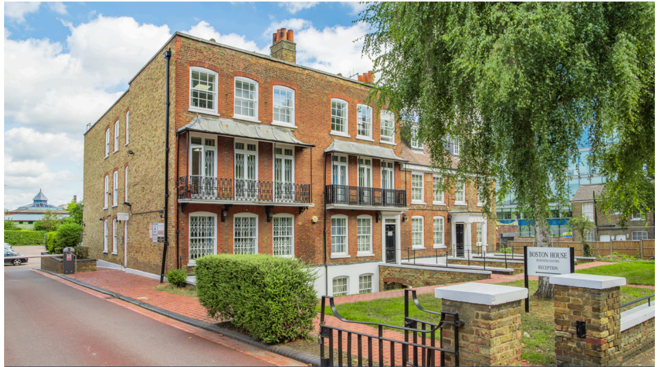
On Site Parking The building boasts a generous allocation of car park bays

Our Brentford offices are conveniently located near the riverside, cafés, shops, and green spaces, including Boston Manor Park and Syon Park. This balance of urban convenience and natural beauty enhances the working day for teams and visiting clients alike.