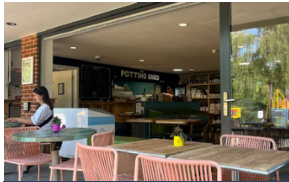
The Potting Shed