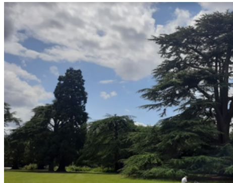
Boston Manor Park