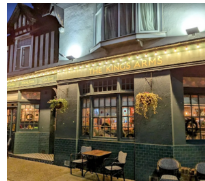
The Kings Arms