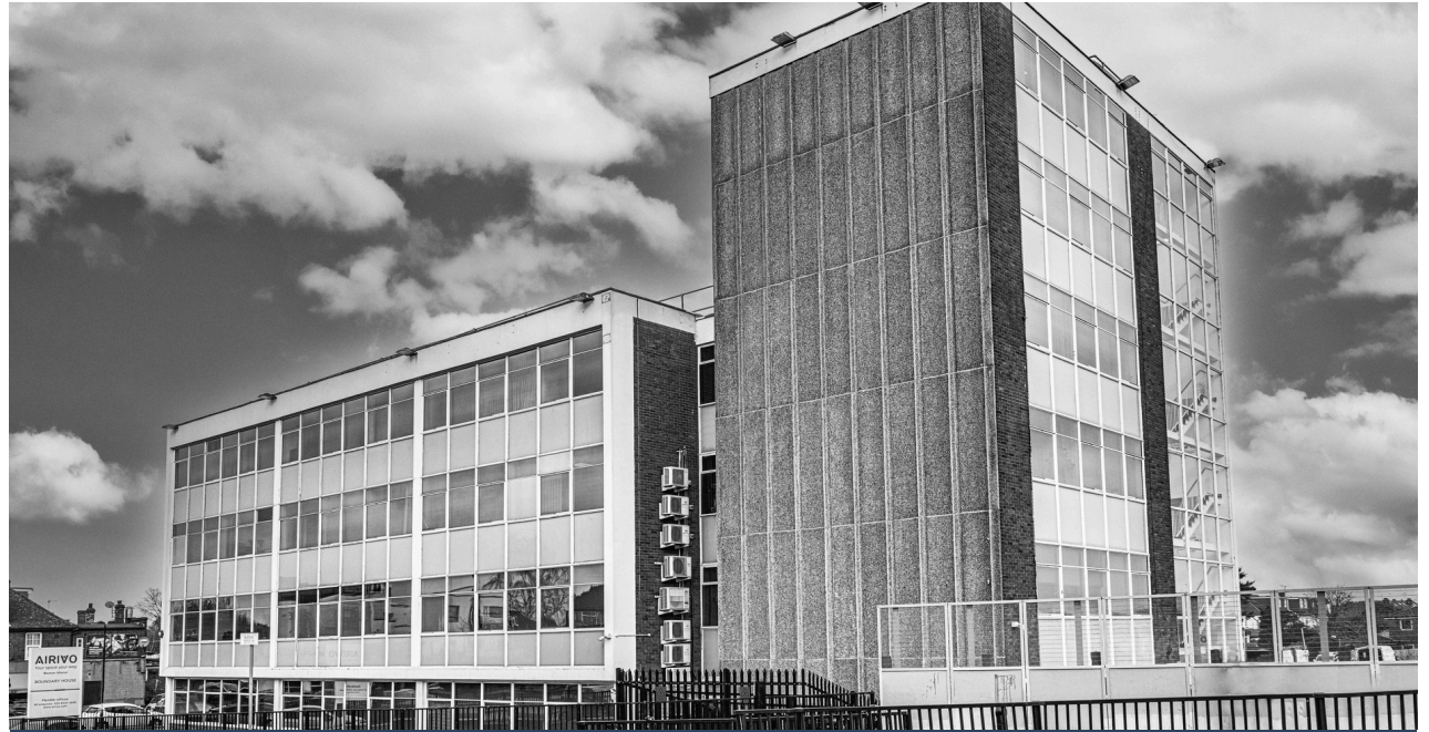
On Site Parking The building boasts a generous allocation of car park bays

With a distinct culture and atmosphere, a variety of cafes and restaurants, proximity to Hanwell and Brentford, and a thriving business community, Airivo Boston Manor offers a unique and attractive business environment.