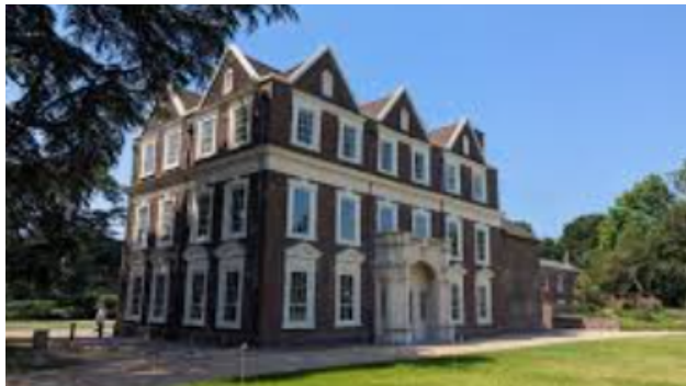
Boston Manor House