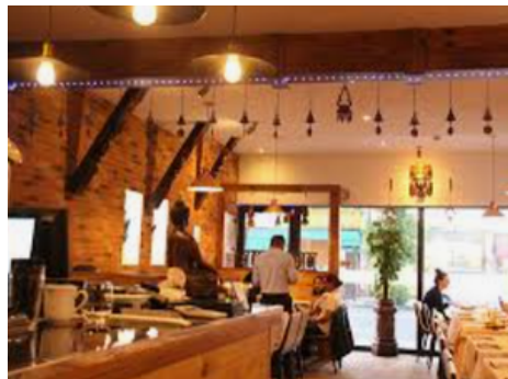
Nepal Authentic Dining