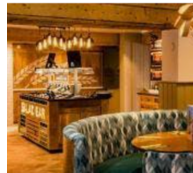
The Royal Harvester