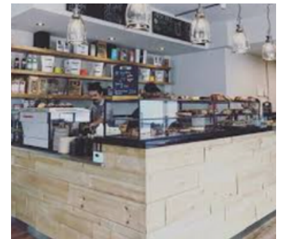
NO. 6 Coffee Shop