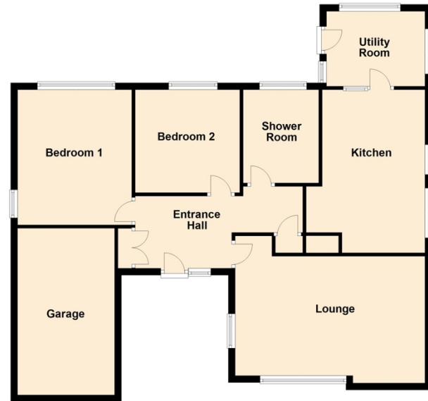
Total area: approx. 96.4 sq. metres (1037.9 sq. feet)

Please note this floor plan is a guide and not to scale. Plan produced using PlanUp.