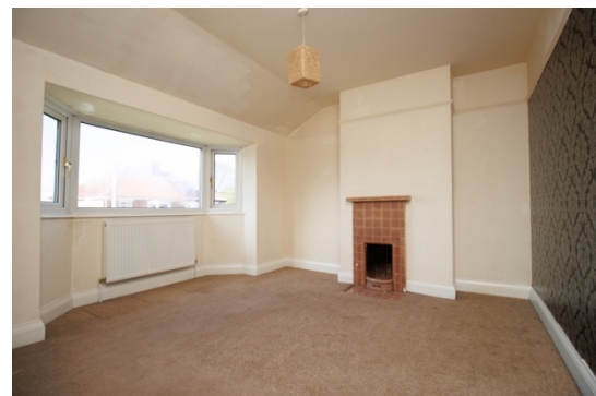
BEDROOM ONE 3.63m x 3.07m (11'11" x 10'1") plus bay.

Feature fireplace. Radiator. Upvc double glazed bay window.