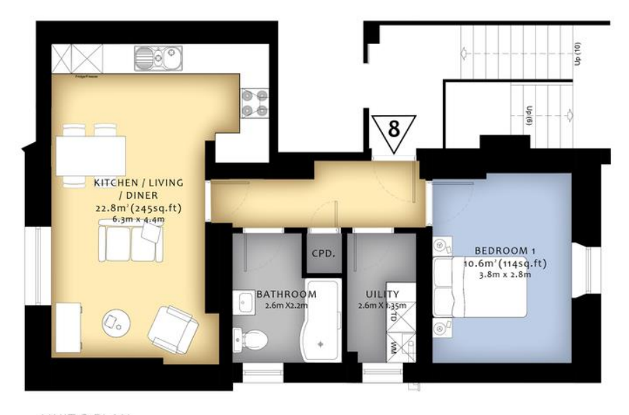
UNIT 8 PLAN