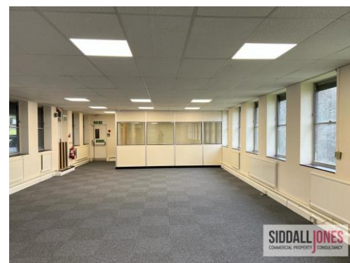
Siddall Jones | The Mill | 95 Tackfield Street | Birmingham | B16 6RU