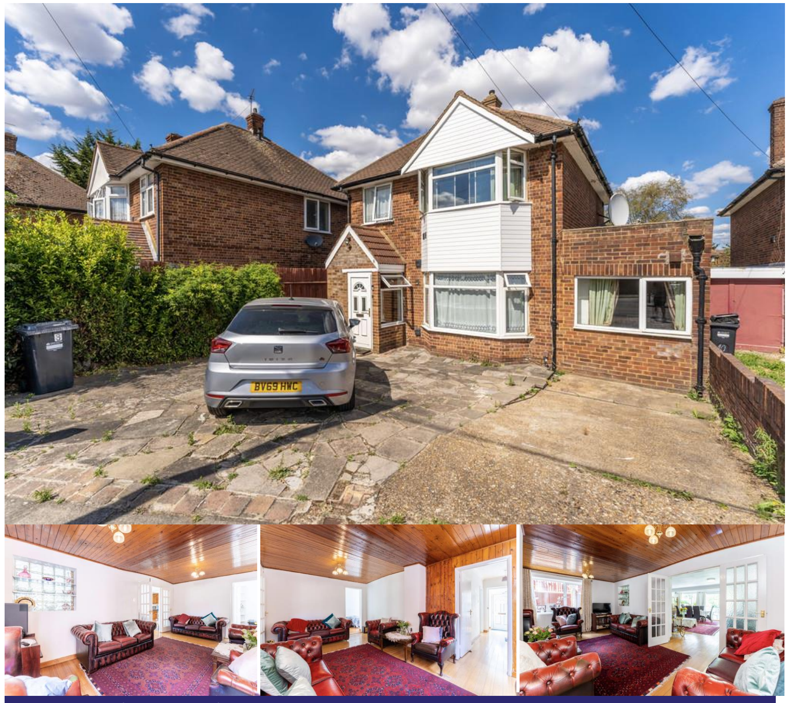
Speart Lane | Hounslow | TW5 9EF

Hiltons Estates brings to the market this Freehold detached 4 bedroom property located in TW5. The property comprises an entrance hallway, 3 well sized reception rooms, bedroom 4, fully fitted kitchen, and shower room on the ground floor. Upstairs, there are 3 well sized bedrooms and family bathroom. There is a paved driveway and a large rear garden with patio area. There is opportunity to extend (STPP). Close by to local shops, schools, amenities. Hounslow West and Hounslow Central Underground stations are within easy reach as are transport links. Brilliant opportunity for Families, Commuters and Investors! Call NOW for further details.