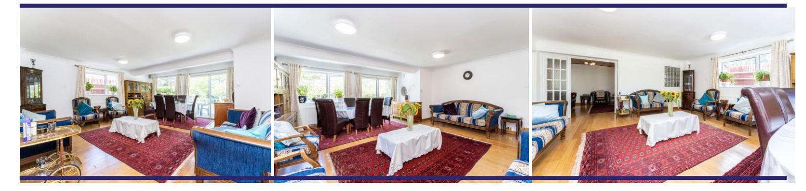
GROUND FLOOR 1090 sq.ft. (101.3 sq.m.) approx.