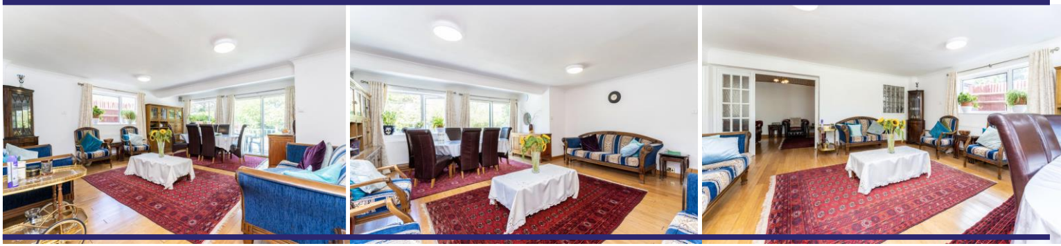
GROUND FLOOR 1090 sq.ft. (101.3 sq.m.) approx.