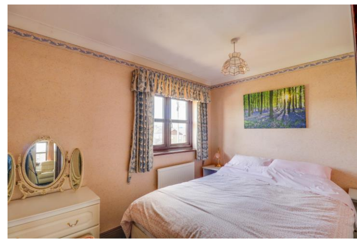
BEDROOM TWO 9' 9" x 7' (2.97m x 2.13m)

Coved ceiling. Obscure uPVC double glazed window to rear aspect. Radiator.