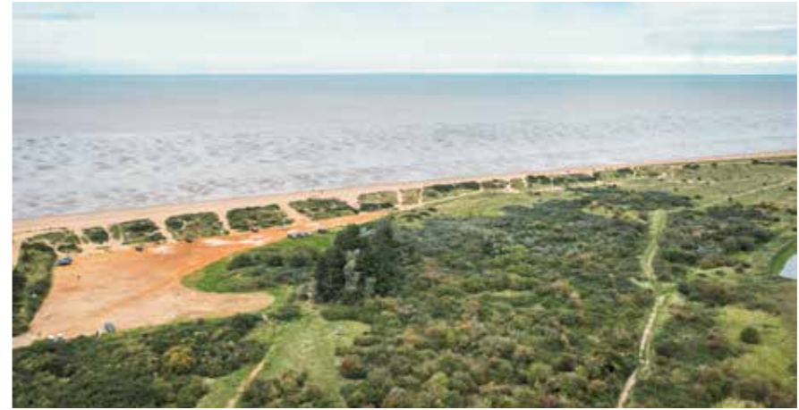
Snettisham Beach and nature reserve

“We love the wildlife and long walks on the beach...”