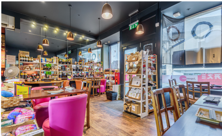
Seating Area 1