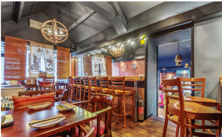
Seating Area 2