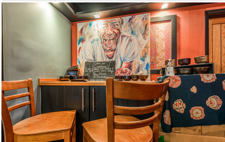
Seating Area 2