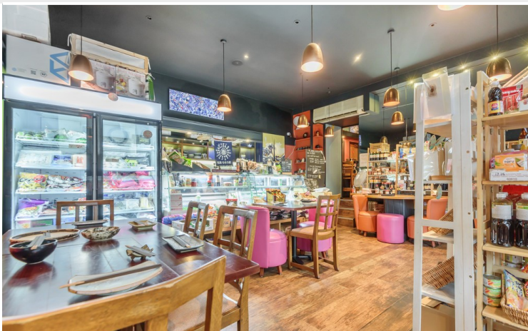
Seating Area 1

Description These superbly placed premises are offered by way of an assignment of a lease extended until August 2028 at a rental of £14,000 pa. Currently operating as a restaurant, take-away and deli, the premises will suit a variety of occupiers and currently specialises very successfully in Japanese cuisine. Previously a wine bar, and a retail shop prior to that, the double fronted 75.45 Sq M of space enjoys excellent road frontage.