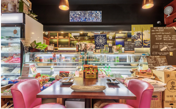
Seating Area 1