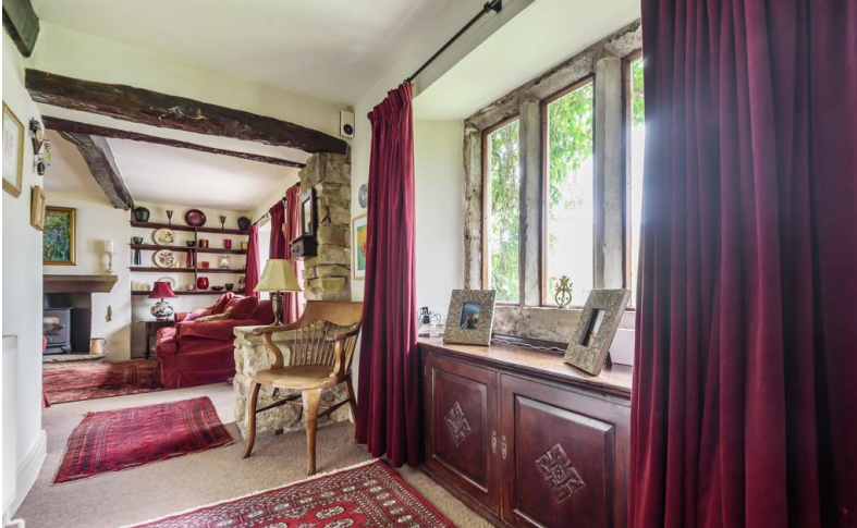
Hallway through to Living Room