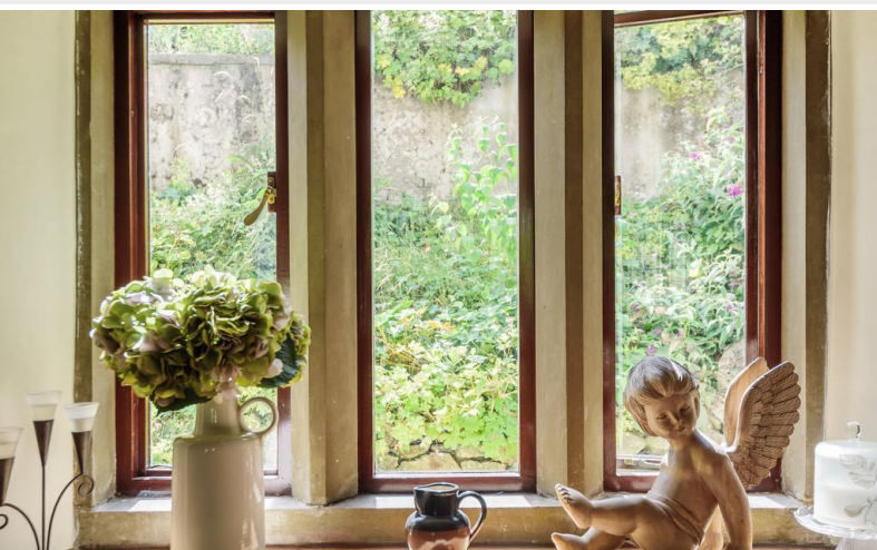
Mullion Stone Windows