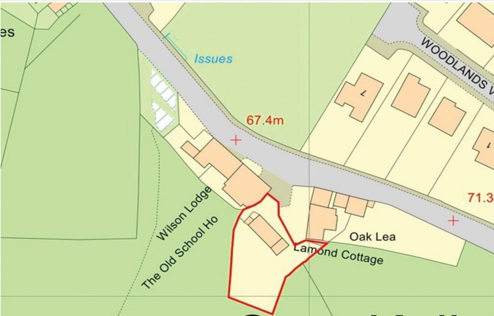
Ordnance Suvey Map - 01054465

Request a Viewing Online or Call 01524 737727