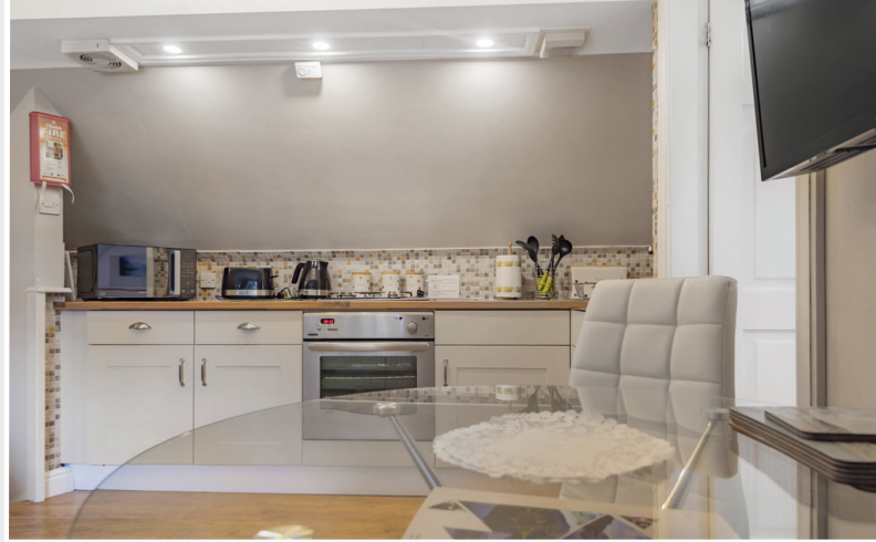
Open Plan Living Room / Kitchen

Energy Performance Certificate The full Energy Performance Certificate is available on our website and also at any of our offices.