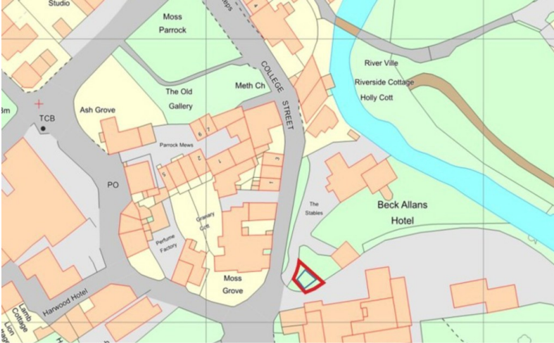
Ordnance Survey 16081123560