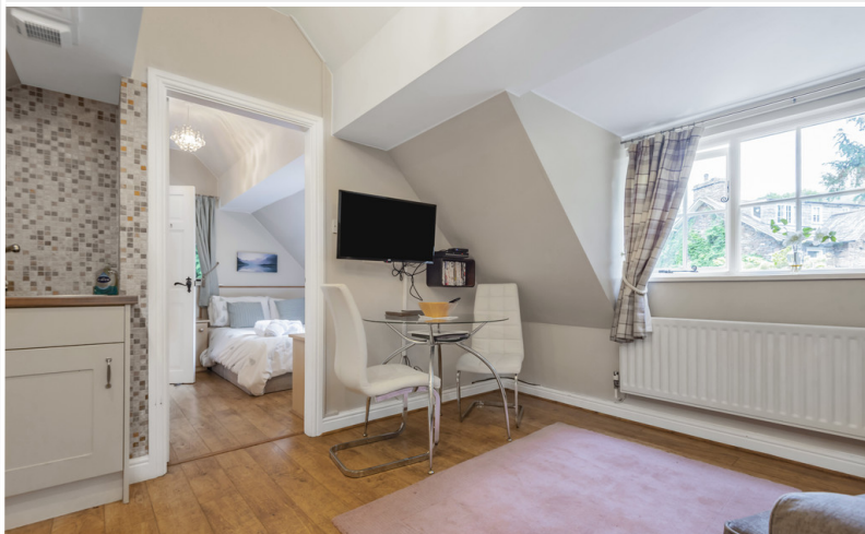
Open Plan Living Room / Kitchen