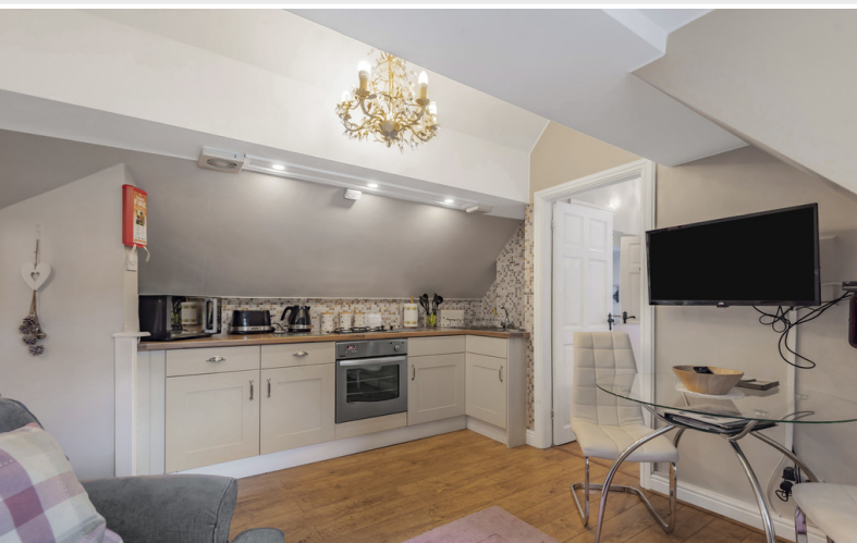
Open Plan Living Room / Kitchen